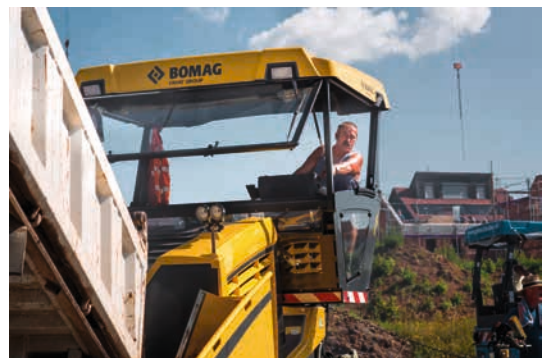
The right position in each situation – the comfortable driver's cabin.